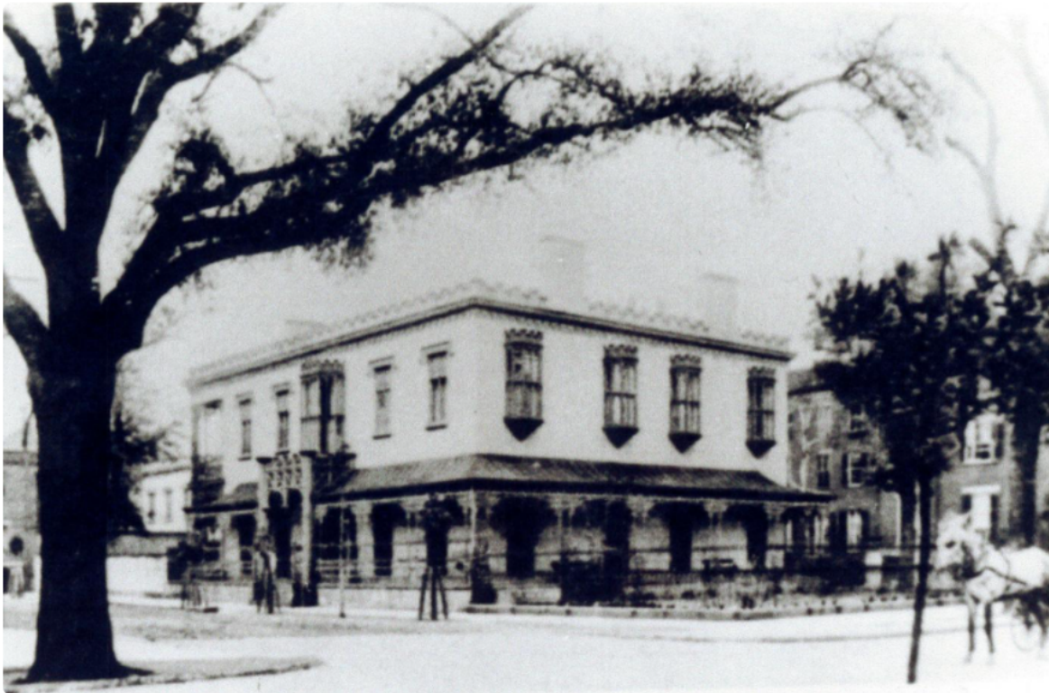
Sherman's Headquarters in Savannah

Trial of Courage begins where Trial by Fire left off. When we first see Tom in this novel, he is still in Atlanta on guard duty. Soon, his regiment joins with General Sherman's entire division on the famous March to the Sea in an effort to "make Georgia howl." This "total war" that Sherman embarked on was a scorched earth policy, which wreaked havoc from Atlanta to Savannah. In December 1864, Sherman famously presented the city of Savannah, GA as a "Christmas gift" to President Lincoln.